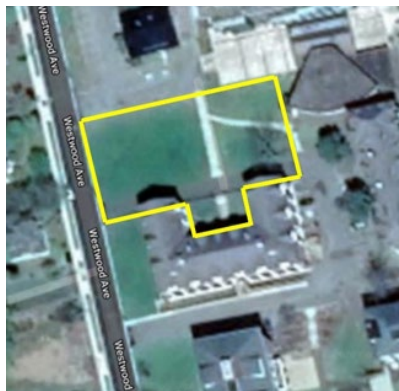
War Memorial House